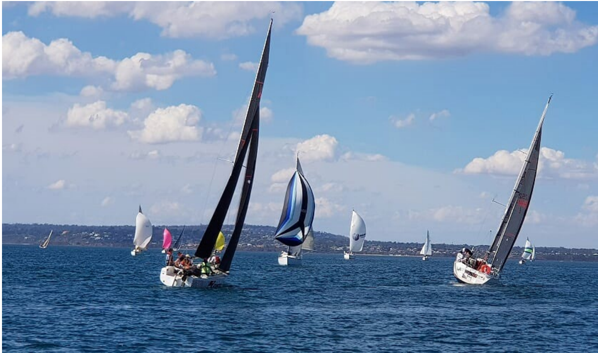
View from the Start Boat on Sunday