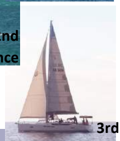
3rd Smooth Operator